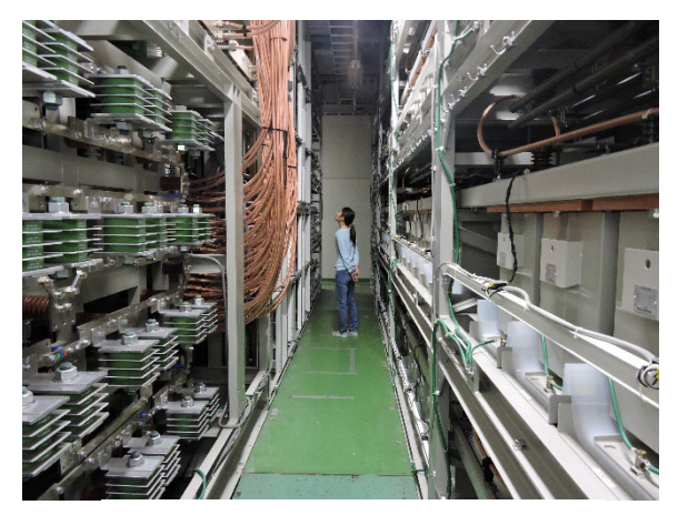
Huge Capacitor Bank System

Conditions", and again in 2006, as the "Center for Quantum Science and Technology under Extreme Conditions". From April 2014, the high magnetic field division in the last KYOKUGEN center started as a new center named "Center for Advanced High Magnetic Field Science" attached to Graduate School of Science.