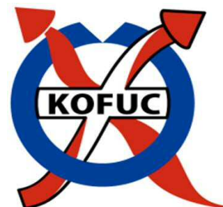
Logo of KOFUC network

http://www.ahmf.sci.osaka-u.ac.jp/index_e.html