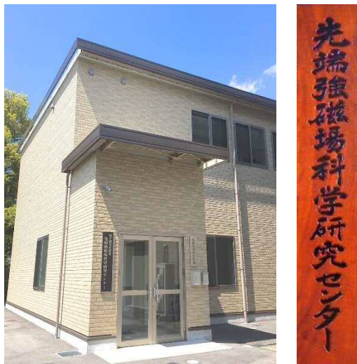
High Magnetic Field Joint-Usage Building and Center signboard

The Center consists of the following five divisions: “Research division of physics I”, “Research division of physics II”, “Research division of chemistry and biology”, “Research division of cooperation”, and “Support division for joint-use”. The steering committee of the Center is operated by members elected from some departments in Graduate School of Science. The full-time members in the Center conduct research and education as a cooperative class and an undergraduate course in the Physics department.