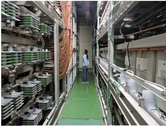
Huge Capacitor Bank System

Conditions”, and again in 2006, as the “Center for Quantum Science and Technology under Extreme Conditions”. From April 2014, the high magnetic field division in the last KYOKUGEN center started as a new center named “Center for Advanced High Magnetic Field Science” attached to Graduate School of Science.