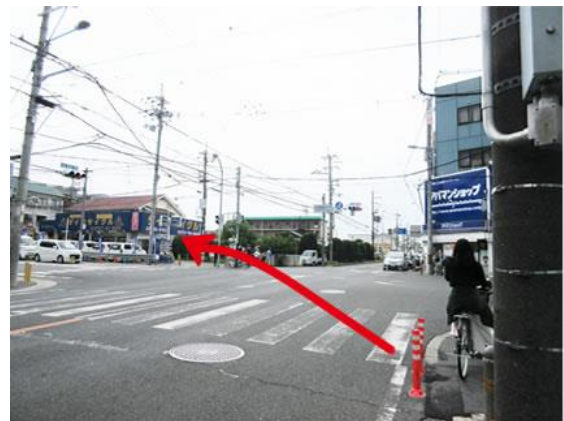
Cross the street toward the signboard of Daiwa Cycle (ダイワサイクル).