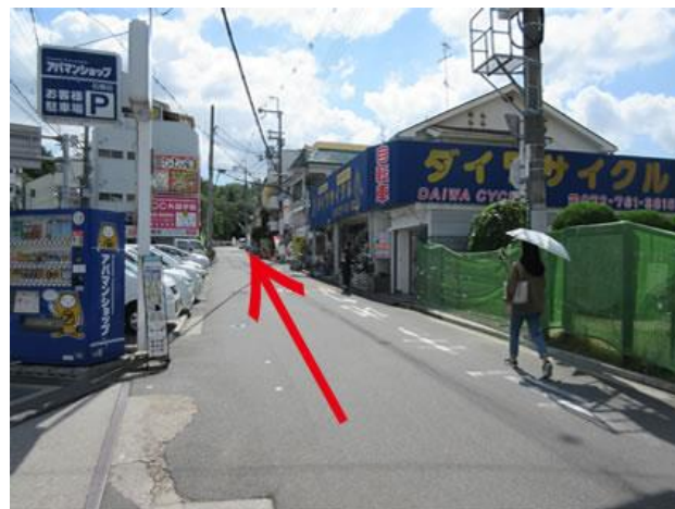
Walk straight ahead with Daiwa Cycle (ダイワサイクル) on your right.