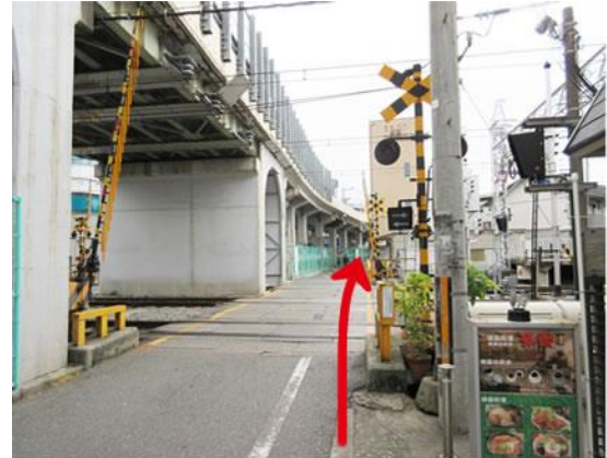
Cross the railroad crossing and go straight ahead.