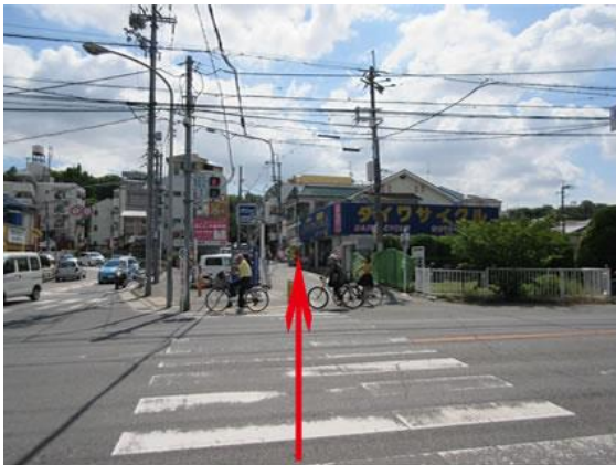
You will come to an intersection called Ishibashi Handaishita (石橋阪大下).