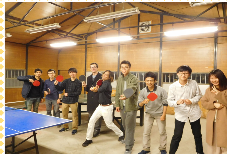
Table Tennis & Thai Cuisine 卓球とタイ料理

2019年12月19日(木) 卓球とタイ料理を楽しむイベントを開催しました。卓球を楽しんだ後は、タイの留学生によるタイ料理がふるまわれました。初めてタイ料理を食べた学生たちも、珍しい食材に興味を持ち、「おいしい!」と大喜びでした。