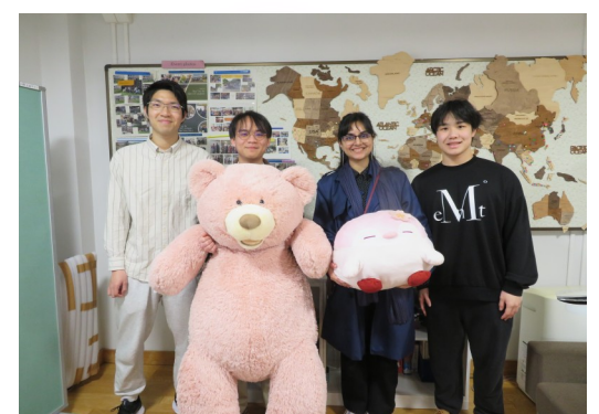
2026年度Science Buddy役員メンバー4名 今年度は全員留学生です！