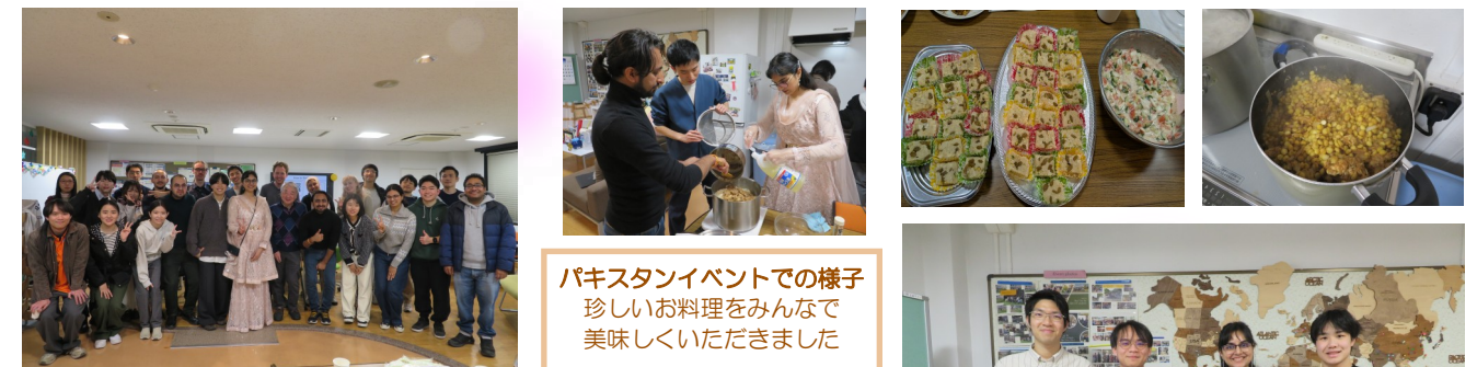
パキスタンイベントでの様子 珍しいお料理をみんなで 美味しくいただきました

Besides my studies, I love exploring new cultures and languages and had been learning Japanese for quite a few years both personally and at my workplace. During my first few weeks at UOsaka, I visited the salon for guidance on various daily-life topics, like getting a new Japanese SIM and guidance to the prayer room and got very welcoming support. Everyone here is super sweet and like one big family. I eventually learned about the many monthly events we have here, and have had many fun trips as well as unique cultural experiences.