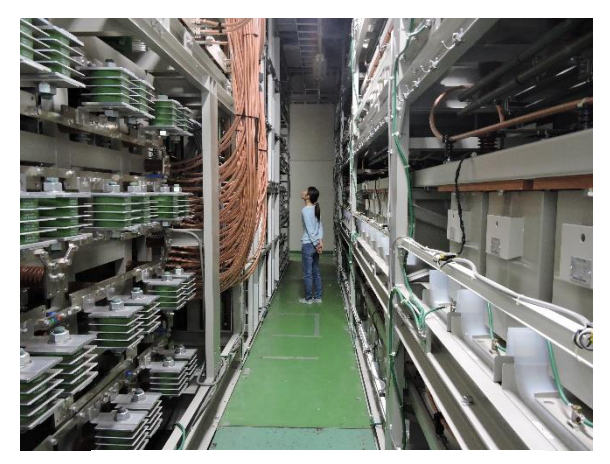
Huge Capacitor Bank System

Conditions", and again in 2006, as the "Center for Quantum Science and Technology under Extreme Conditions". From April 2014, the high magnetic field division in the last KYOKUGEN center started as a new center named "Center for Advanced High Magnetic Field Science" attached to Graduate School of Science.