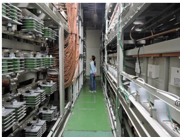
Huge Capacitor Bank System

Conditions”, and again in 2006, as the “Center for Quantum Science and Technology under Extreme Conditions”. From April 2014, the high magnetic field division in the last KYOKUGEN center started as a new center named “Center for Advanced High Magnetic Field Science” attached to Graduate School of Science.