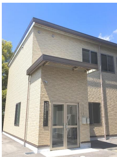
High Magnetic Field Joint-Usage Building and Center signboard