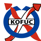
Logo of KOFUC network

http://www.ahmf.sci.osaka-u.ac.jp/index_e.html