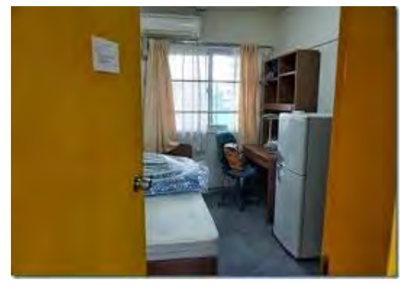
Tsukumodai International Student Dormitory