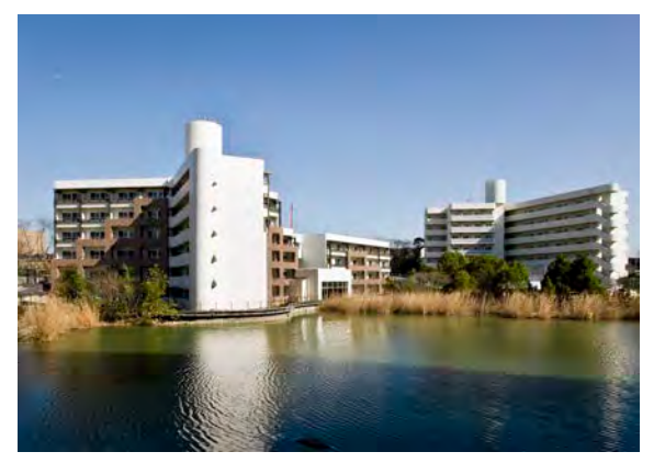
Osaka University International House, Toyonaka