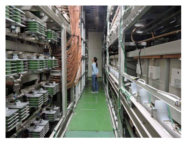
Huge Capacitor Bank System

Conditions", and again in 2006, as the "Center for Quantum Science and Technology under Extreme Conditions". From April 2014, the high magnetic field division in the last KYOKUGEN center started as a new center named "Center for Advanced High Magnetic Field Science" attached to Graduate School of Science.