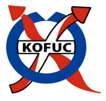
Logo of KOFUC network

http://www.ahmf.sci.osaka-u.ac.jp/index_e.html